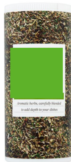
Dried mixed herbs